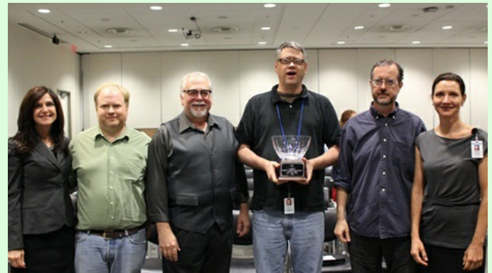
'The Commercial Appeal' wins Corporate Knowledge Bowl 2013!