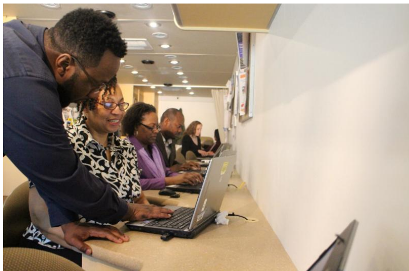
Aboard Memphis Public Library's JobLINC Bus

Taking Care of Your Ride (Teens) - Thursday, June 2, 2016, 2 pm - 3 pm @ Hollywood Library (1530 North Hollywood Street)