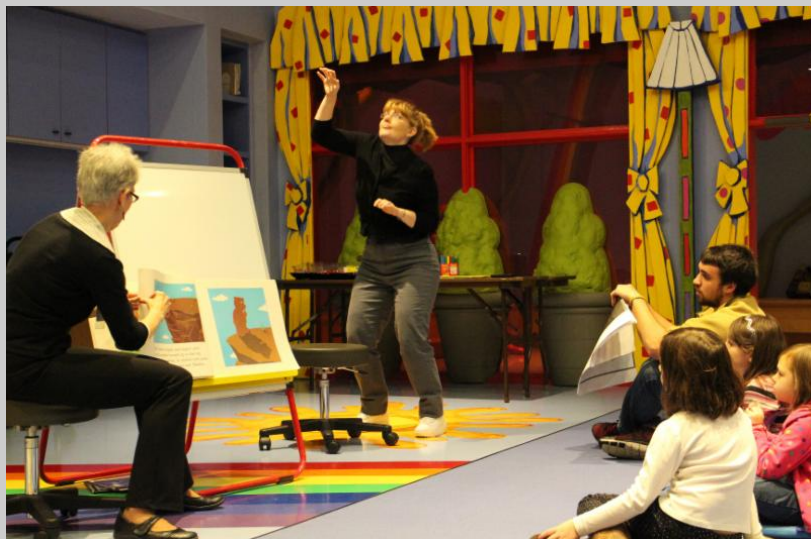
Read with Me, Sign with Me Storytime

Free Saturday Legal Clinic (Adults) - Saturday, May 14, 2016, 10 am - noon @ Benjamin L. Hooks Central Library (3030 Poplar Avenue)