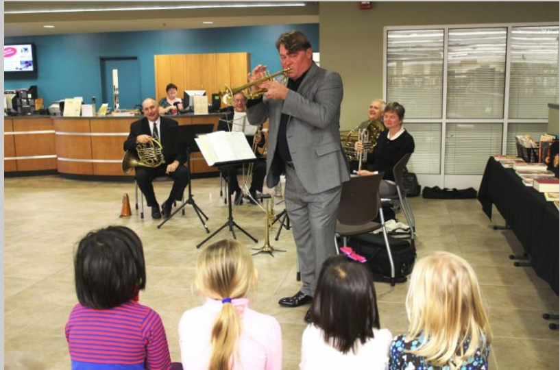
Family Tunes and Tales Storytime

Genealogy Workshop: Census Records (Adults) - Tuesday, May 10, 2016, 5:45 pm - 6:45 pm @ Benjamin L. Hooks Central Library (3030 Poplar Avenue)