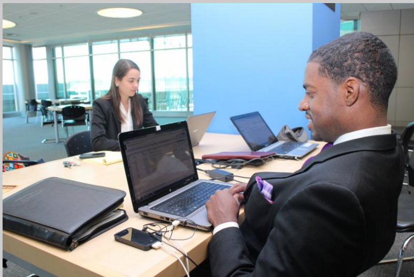
Start Co. Small Business Mentoring

Critical Thinking & Problem Solving (Adults) - Saturday, May 21, 2016, 10 am - noon @ Cornelia Crenshaw Library (531 Vance Avenue)