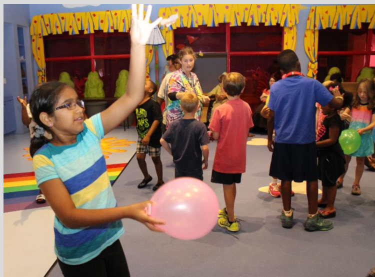
Explore Memphis 2014

Summer days are filled with free fun and discovery at Memphis Public Libraries during Explore Memphis 2015 . As soon as the last school bell rings, a list of cool programs awaits kids at Memphis Public Libraries citywide, starting in June 2015.