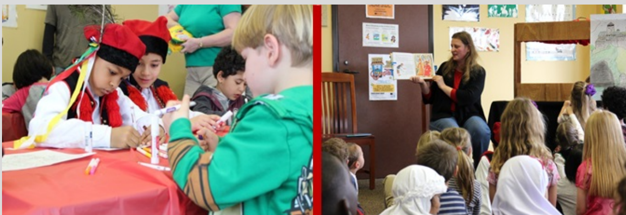
International Storytime 2014 at Cordova Library