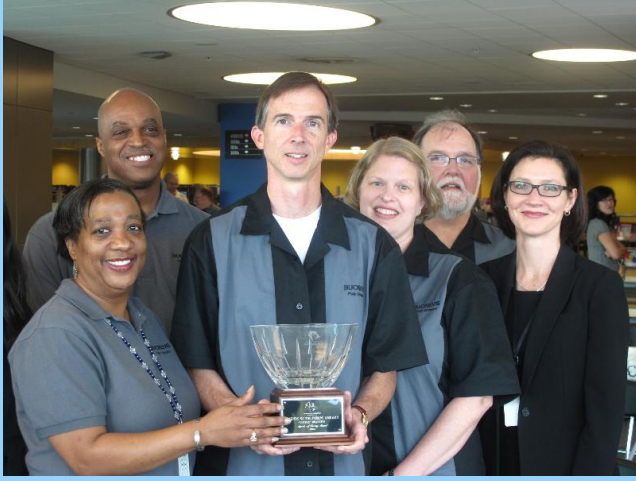
2012 Corporate Knowledge Bowl Winners - Buckeye