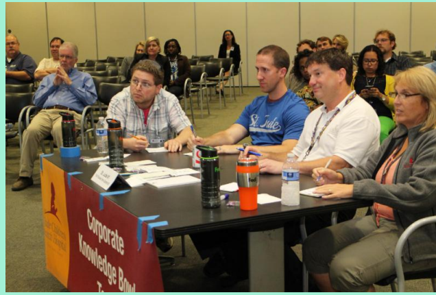
Corporate Knowledge Bowl 2014 Winners St. Jude Children's Research Hospital

Teams are forming now! The deadline for entry is September 4, but discounted rates are available for companies that register early.