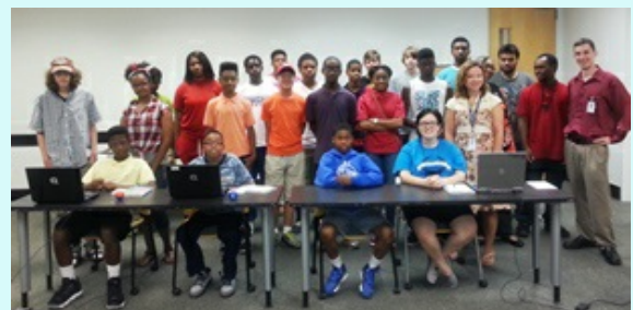
Teen Tech Camp 2013

In previous camps, teens have learned to create their own video games, but event organizers say TTC 2014 has a special surprise in store!