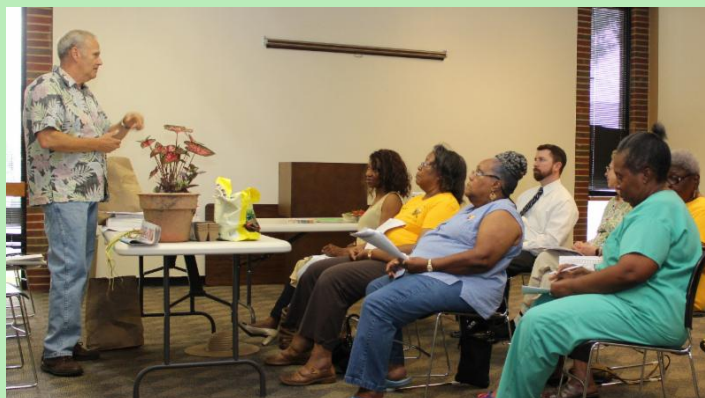
Customers learned the secrets of great gardening at Cherokee Library

Meeting the needs of customers is nothing new for librarians at Cherokee Library or throughout The Memphis Public Library & Information Center. Cherokee is home to the Library