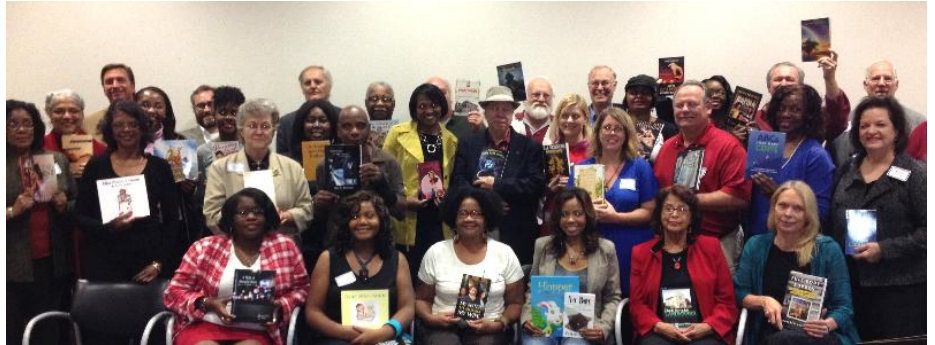
Local authors from Memphis Public Library's BOOKSTOCK 2012 stopped to display their published work.

Library customers can stock up on books by local authors at Bookstock and Bookstock, Jr. 2013 , annual events at the Benjamin L. Hooks Central Library (3030 Poplar Avenue) for local writers - young and old - to showcase their published work in a family-fun setting. This year's event is set for Saturday, October 5, 2013, 10:30 am - 3:30 pm.